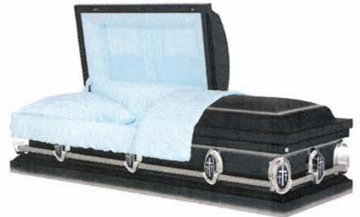
Ridgeway Spruce Blue

Material: 20 Gauge Gasketed Steel Exterior Finish: White Shaded gold Interior Finish: White Crepe Price: $2,795