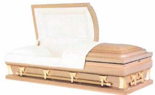
McKinley White Sand 28

Material: 20 Gauge Gasketed Steel Exterior Finish: Blue Interior Finish: Silver Crepe Price: $3,095