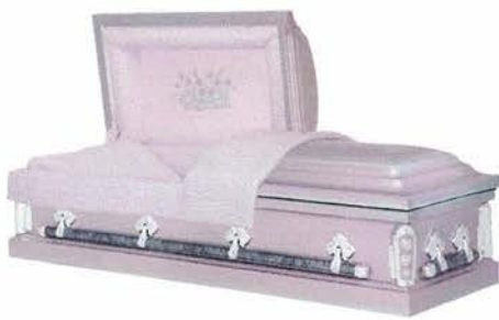
Orchid Blend Grey

Material: 18 Gauge Gasketed Steel Exterior Finish: Grey Interior Finish: Orchid Crepe Price: $3,695